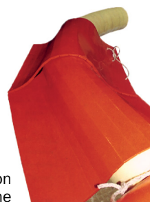
Njord Polymat in position over a subsea pipeline