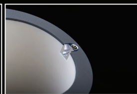
Durable & precise registration Aluminum insert