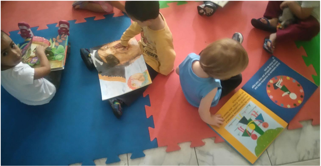
Activity with the Children – Using the collection