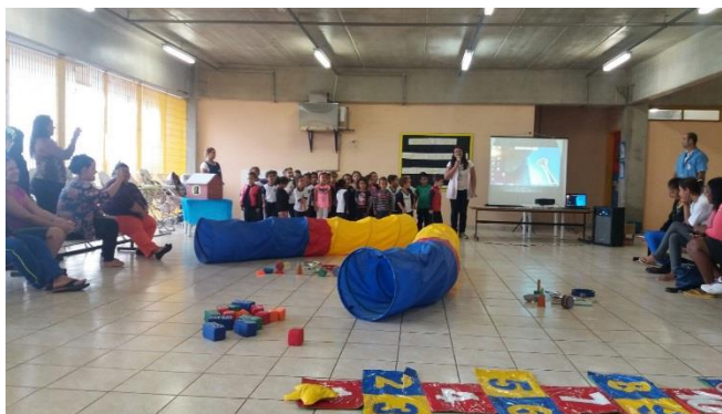
Activity with the families