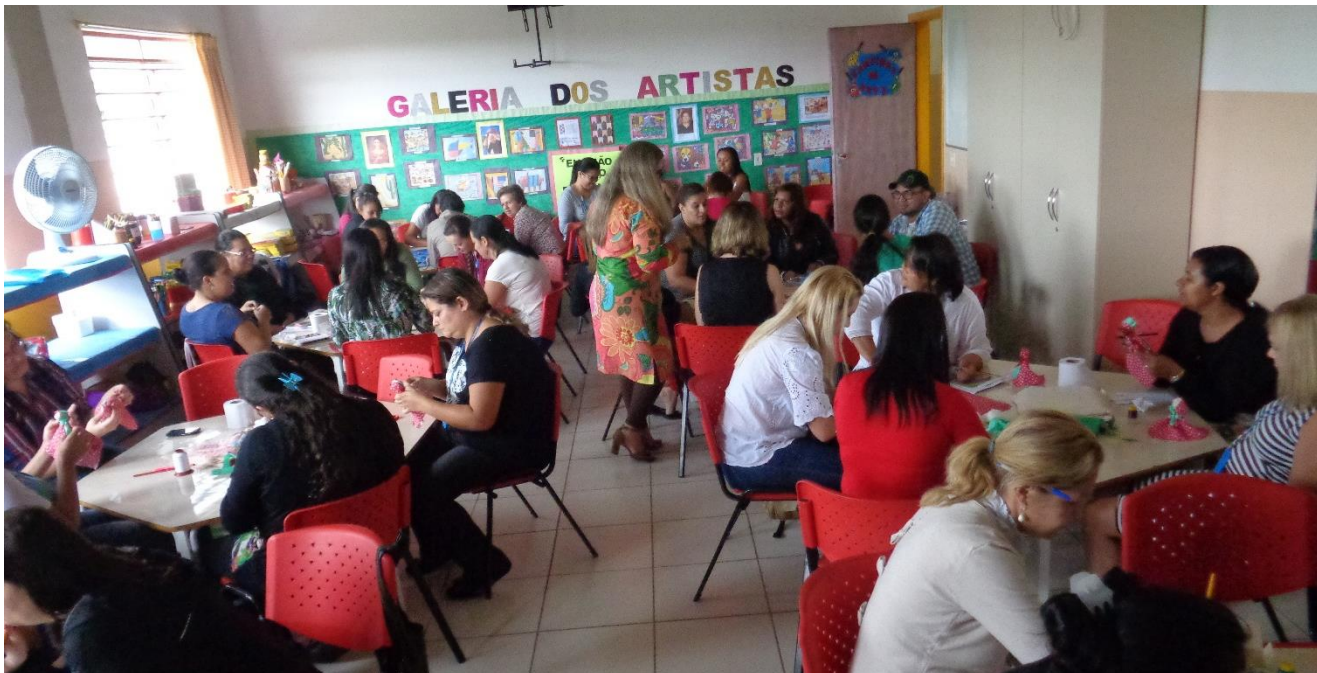
Training activities with the education project professionals