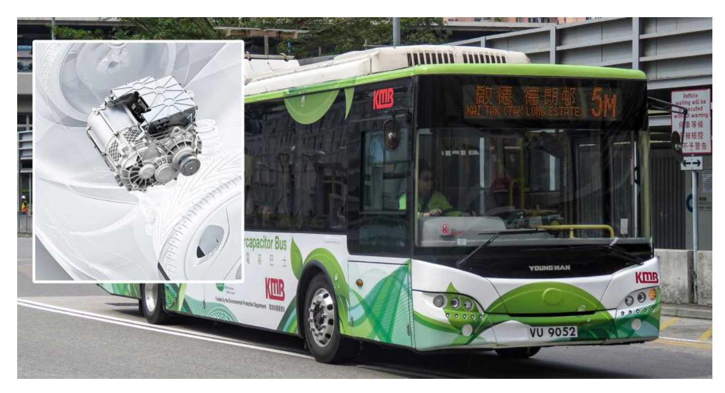
TECHNOLOGIES > MOTION CONTROL