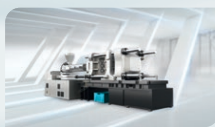
Manufacturing & Machine Tools