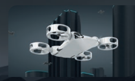
Advanced Air Mobility

Trelleborg Aerospace offers a full portfolio of solutions and services for nearly any aerospace application. Materials and products can be used in any type of aircraft and our products are designed to provide maximum efficiency to customers. In addition to our experience in the aerospace industry, we are also able to offer solutions based on industrial technology where full aerospace certification is not required.