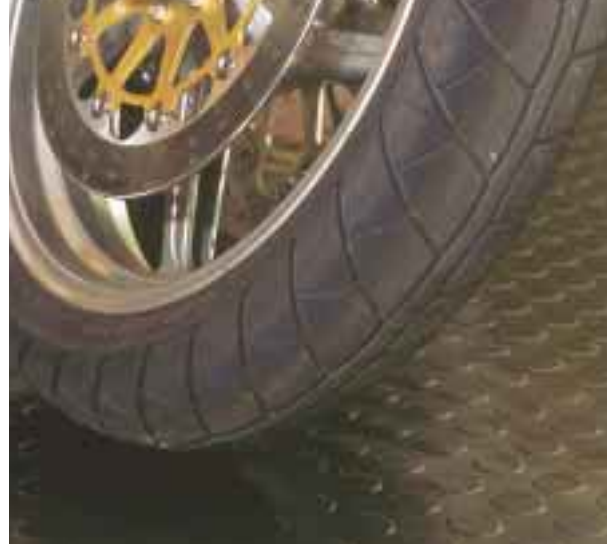
Resilient to physical wear