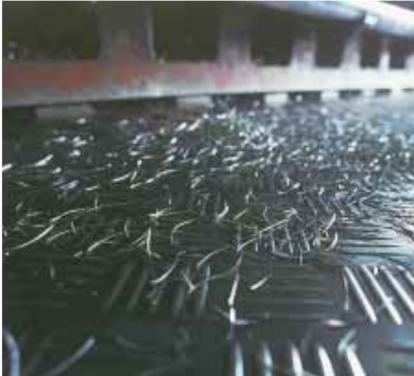
Deadens sharp sounds