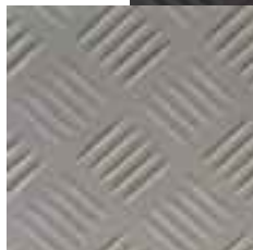
Checker Chequered pattern