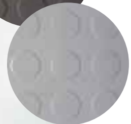
Checker Stud Low-profile stud pattern