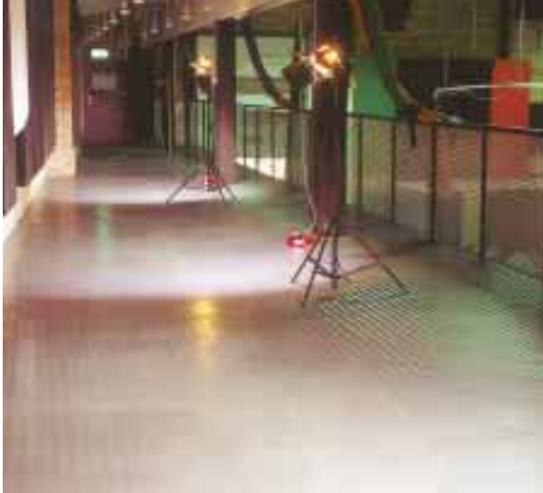
Better working environment