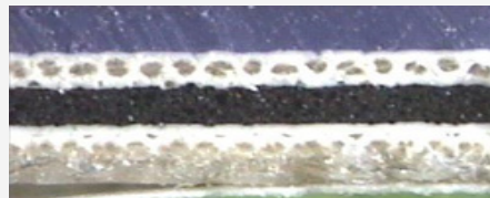
Printec 8263 laser engraved

Printec 8263 is available in 3 ply (1,97 mm) thickness