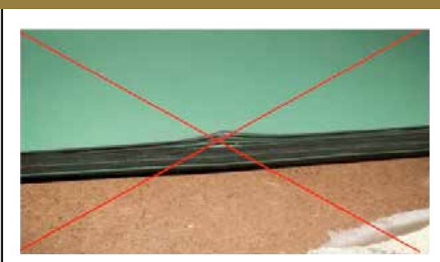
These MBB has been damaged by a wrong box opening