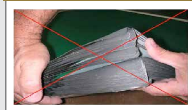
These MBB has been damaged by a wrong transportation or storage