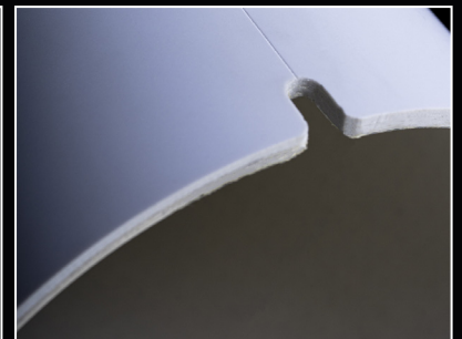
Easy positioning of adhesives and plates thanks to scribe lines