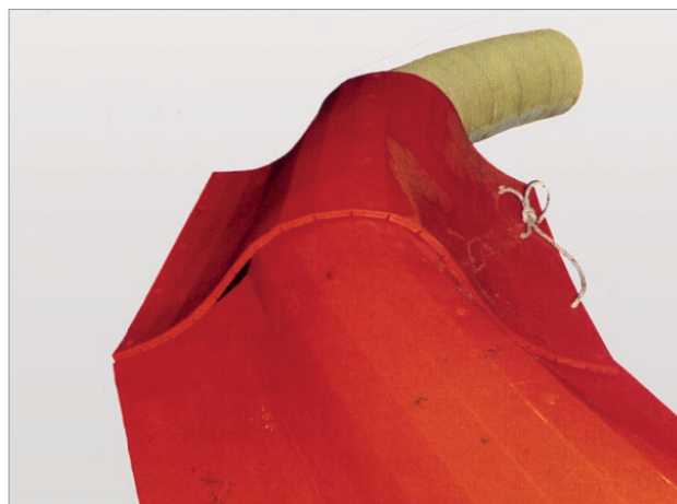
Polymats™ in position over a subsea pipeline