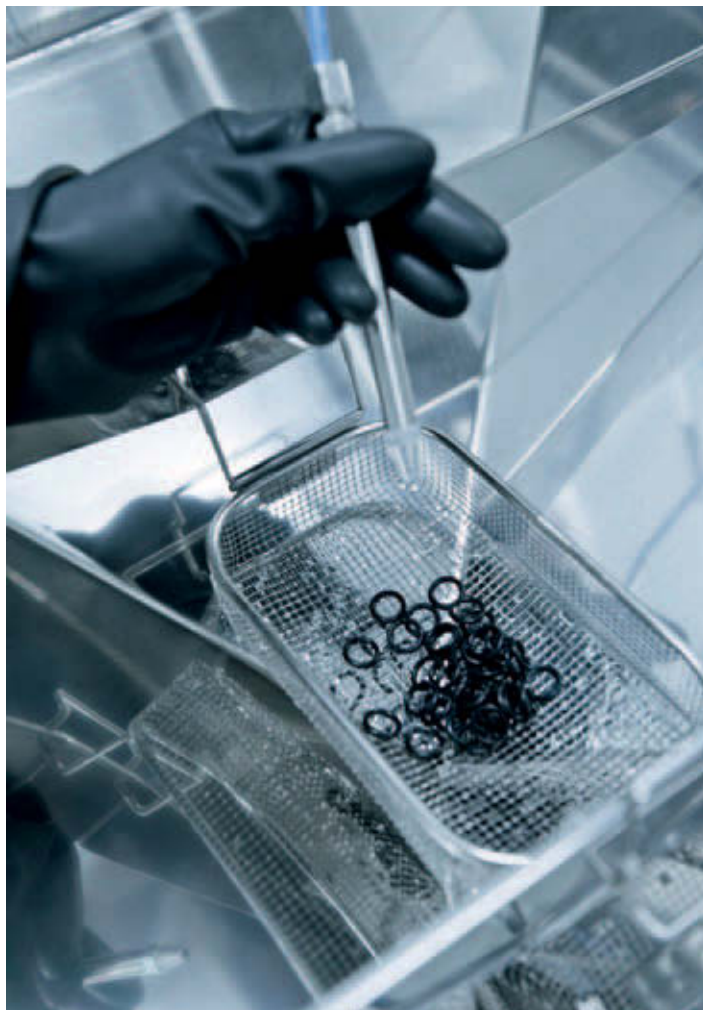
Examination of seals for particulate residual contamination by means of pressure rinsing method according to ISO 16232.

For seals to Class 5 cleanroom quality according to ISO 14644-1 there is a permanent and adequate verification of the cleanroom zones according to ISO 14644.