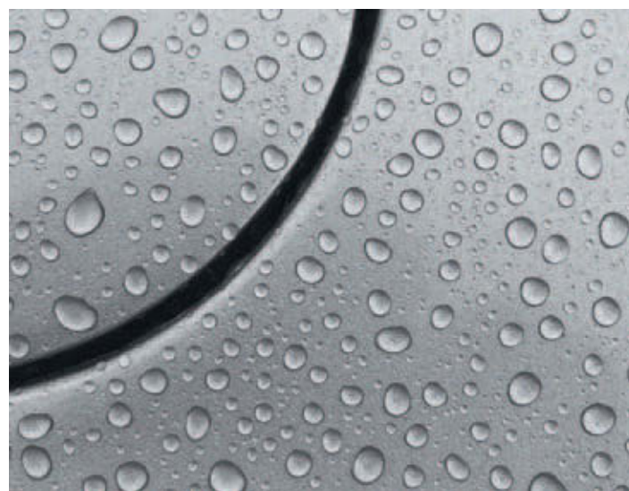
Faultless paint on a silver car body

By default, Trelleborg Sealing Solutions works on the Volkswagen test specification PV 3.10.7.