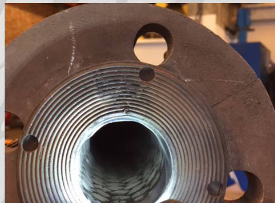
PERFORMER CERAMIC hose inside after 32 weeks of use

Much longer lifespan vs ceramic hose competitor.