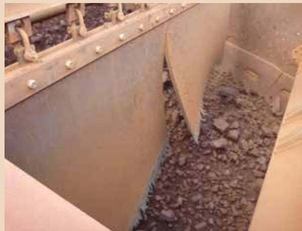
Trelleborg Rock Curtains 9 months later in November 2014.