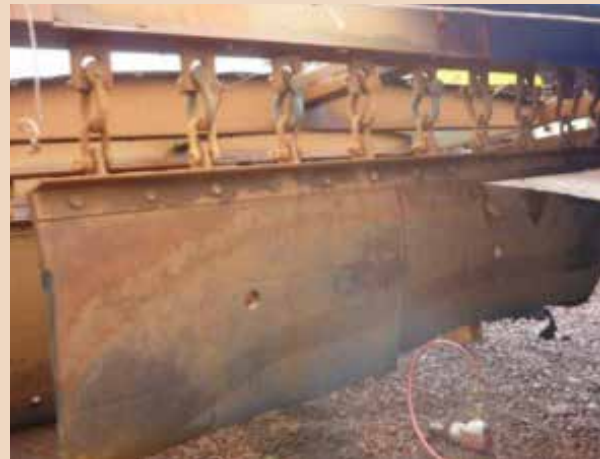
Old curtains replaced with Trelleborg Rock Curtains in March 2014.