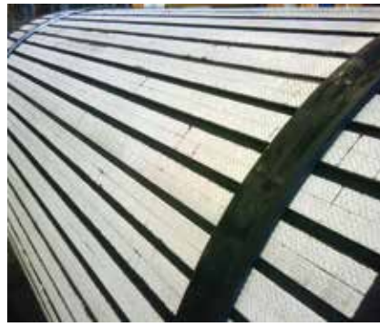
Drive Pulley Ceramic