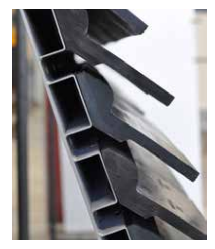
Typical chute lining arrangement

Site reference can be supplied upon request.