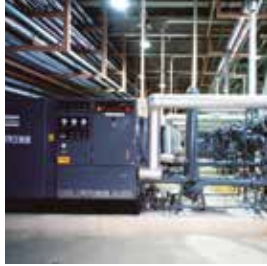
Trelleborg Industrial Solutions