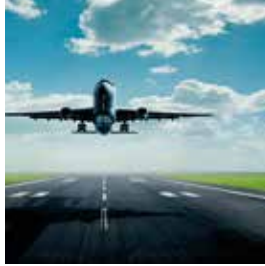
Trelleborg Sealing Solutions