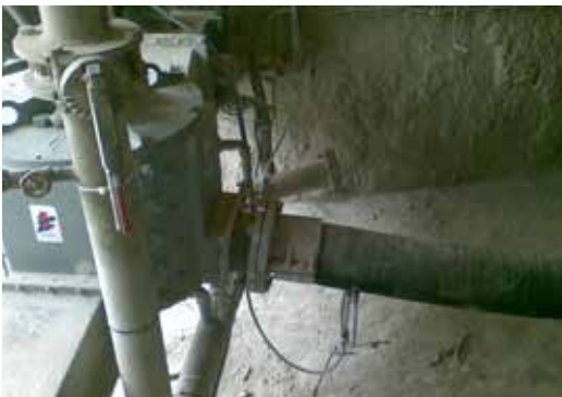
Cement plant Scirocco II hose connected to an airslide.