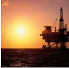
Trelleborg Offshore & Construction