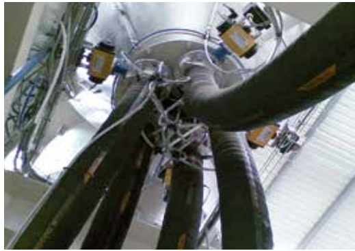
Micro-silica conveying 1 silo feeds 5 separate lines.