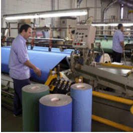
Trelleborg Coated Systems

Trelleborg is a world leader in engineered polymer solutions that seal, damp and protect critical applications in demanding environments. Its innovative engineered solutions accelerate performance for customers in a sustainable way.