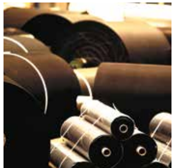
Rubber sheeting and matting