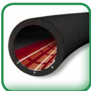
Main air channels