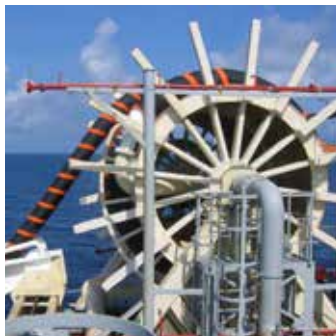
Oil & Gas hoses