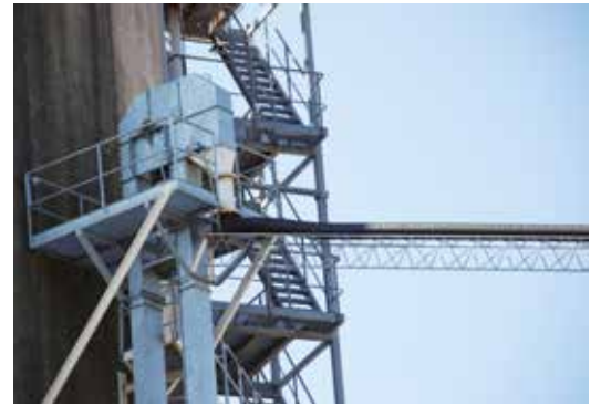
Cement plant Scirocco II hose connected to a bucket elevator.