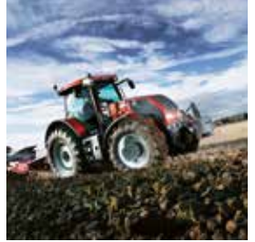
Trelleborg Wheel Systems