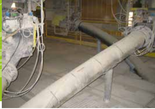
Cement plant 10» Scirocco II for truck loading.