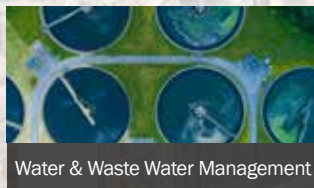
Water & Waste Water Management