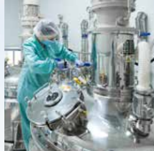
Trelleborg Industrial Solutions