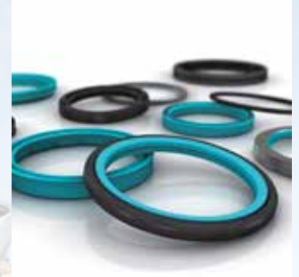
Trelleborg Sealing Solutions