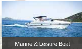
Marine & Leisure Boat