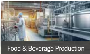
Food & Beverage Production