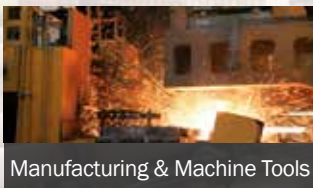
Manufacturing & Machine Tools