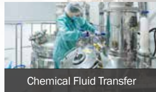
Chemical Fluid Transfer