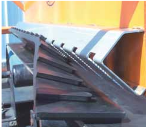
Easy peel-away removal