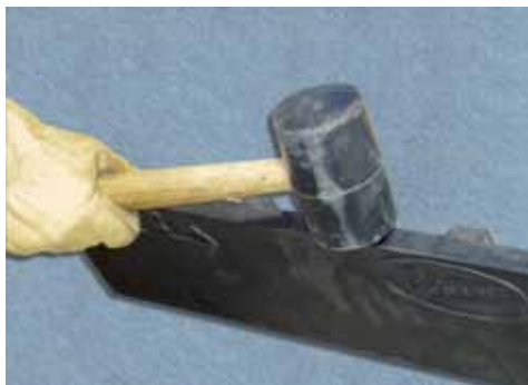
The skirting holds securely and adjusts in seconds by pushing down or tapping with a mallet.

From severe duty hard-rock installations to self adjusting rubber that contours and flexes with the belt to prevent dust leakage, the EZ-SKIRT® Skirting System is probably the most simple and effective sealing system in the world. The sealing strip is high quality press moulded rubber that substantially outlasts conventional skirting. Plant Managers and maintenance personnel alike are finding that the EZ-SKIRT® Skirting System provides the quickest return on investment for their conveyor system. EZ-SKIRT® is SIMPLE, QUICK and EFFECTIVE.