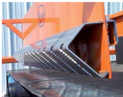
Stitch weld hanger to hopper (45° shown)