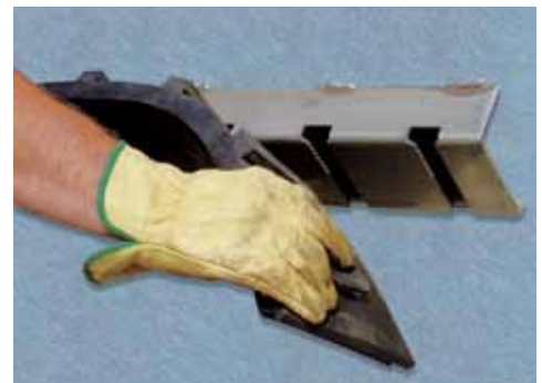
Quick, easy peel-away removal for maintenance.