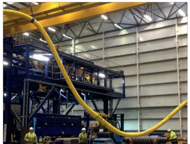
Full-scale testing of Trelleborg's NjordGuard™ integrated protection system