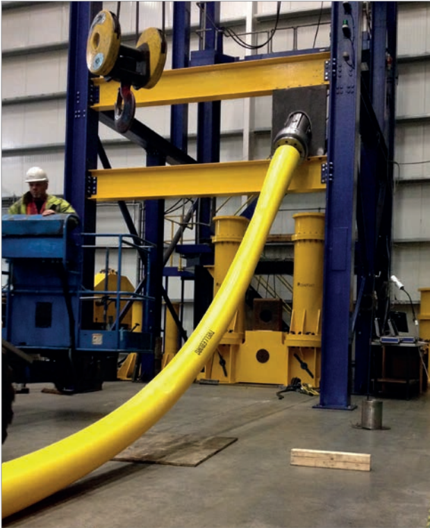
Full-scale NjordGuard™ installation into a mock monopile, during testing