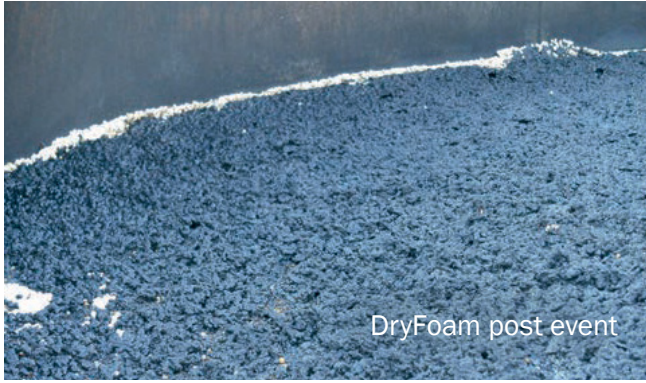
DryFoam post event