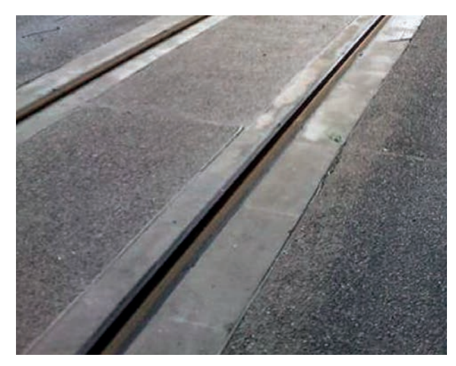
Typical Embedded Track