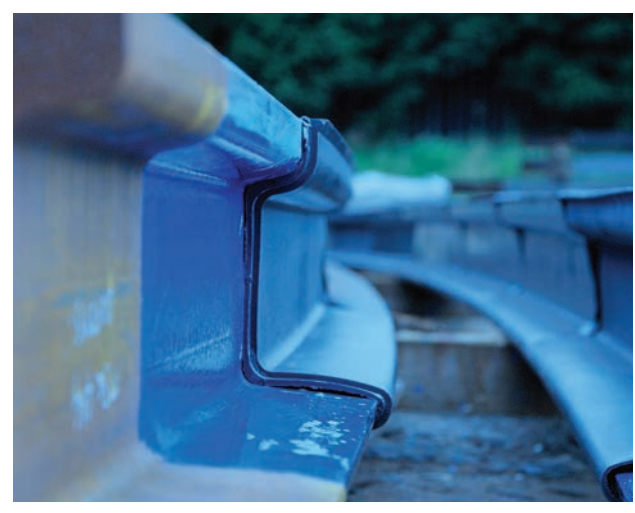
Vector<sup>™</sup> Assembled Embedded Rail