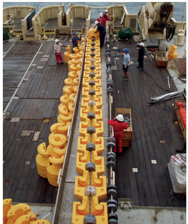
Njord Polyspace installation on offshore vessel

Njord Polyspace is a product specifically designed to generate a guaranteed 350 mm clearance between a cable and a pipeline. This system is flexible and comprises interlocking hollow marine grade High Density Polyethylene (HDPE) halfshells fastened around the cable by corrosionresistant metallic banding. Internal cable clamps are used to lock the Njord Polyspace mouldings onto the cable at regular intervals and specific leading and trailing bending stiffeners can also be included with the system to prevent the cable exceeding the recommended minimum bend radius at any time during the installation.