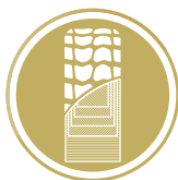
ALL-STEEL RADIAL CONSTRUCTION