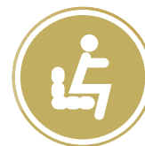
EXCELLENT RIDE COMFORT