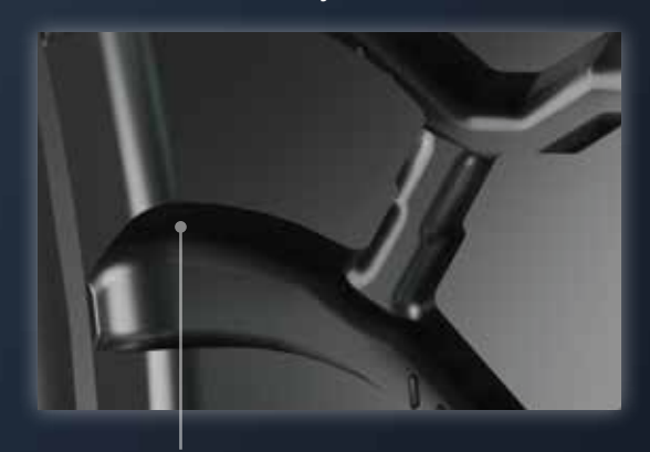
+10% vs Premium Competitor

The deeper tread provides longer tire life and boosts the efficiency of your machine. The casing can also be retreaded, maximizing your investment in a sustainable way.