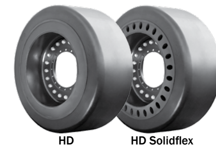
• Comfortable ride when compared to foam filled pneumatic tires

Brawler<sup>®</sup> HD tires are designed to perform in extreme environments where good ride quality is required including scrap metal recycling centers, waste transfer stations and mining operations. The Brawler<sup>®</sup> HD features a two piece patented wheel and disk system that allows tire and wheel interchangeability by simply changing the disk.