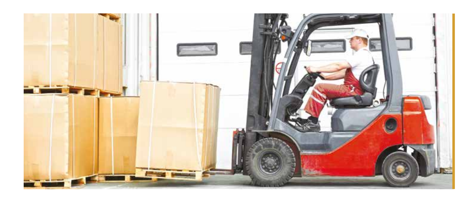
PRESS ON SOLID