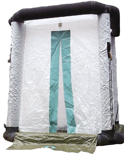
Decon Cabin 200