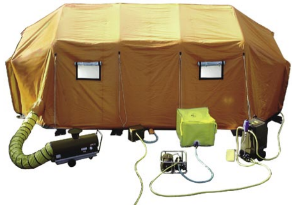
Mass Decon System 445

A variety of decon cabins and a mass decon shelter for up to four lanes of people. All are of a lighter design compared to the standard TrellTent® DS system.