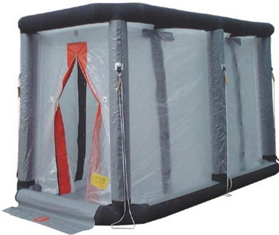
Decon Cabin 400