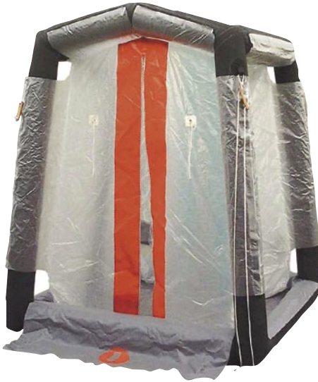
Decon Cabin 100