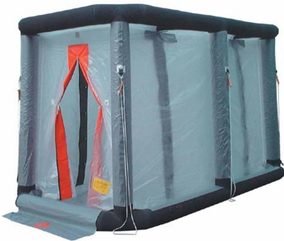
Decon Cabin 400