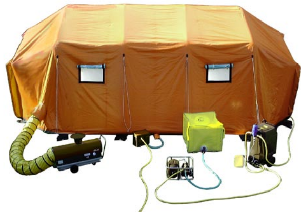
Mass Decon System 445

A variety of decon cabins and a mass decon shelter for up to four lanes of people. All are of a lighter design compared to the standard TrellTent® DS system.