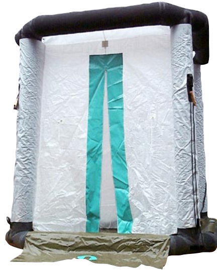
Decon Cabin 200