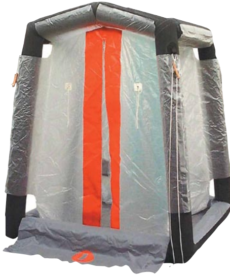
Decon Cabin 100