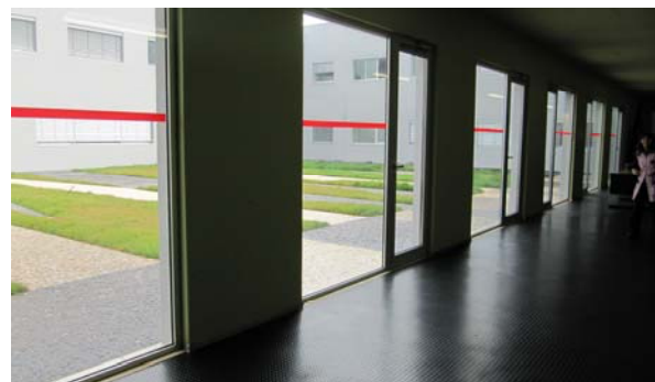
Fire resistant matting

Please, contact us at: izarra@trelleborg.com