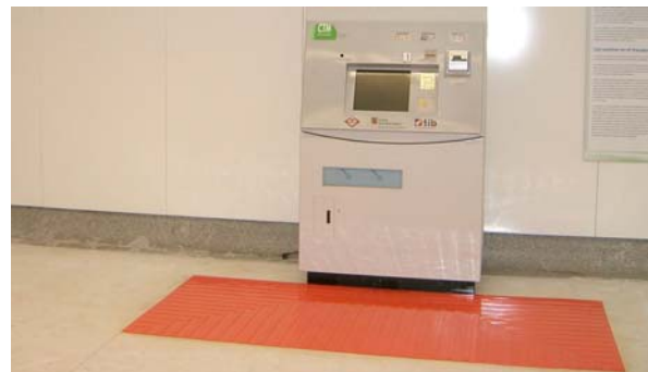
P. Mallorca underground, ticket machine location