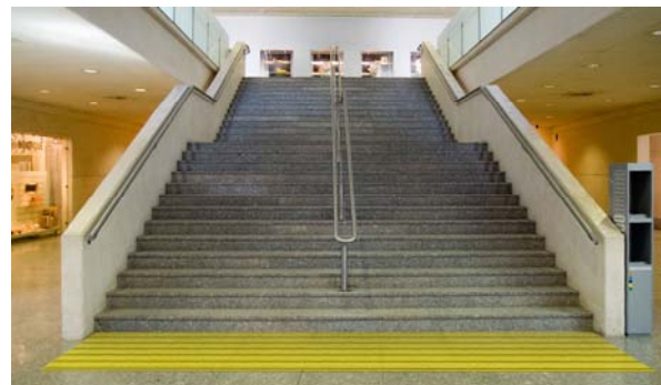
Museum main entrance, stairs access area

Please, contact us at: izarra@trelleborg.com