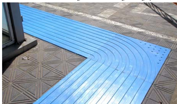
Malvarrosa beach, single junction detail