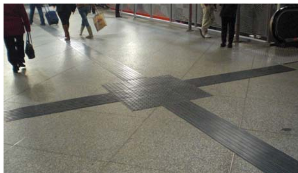
Atocha station, guidance path and multidirect. junction