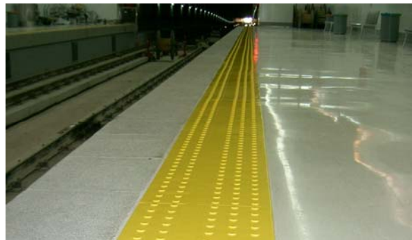
P. de Mallorca underground, platform edge

Please, contact us at: izarra@trelleborg.com