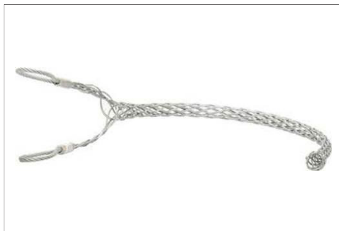
Wire cable stocking: "Secure hose sleeve"