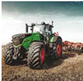
Trelleborg Wheel Systems