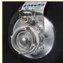
*OFT Pipe plug with bypass

All models suitable for testing according to NEN-EN 1610