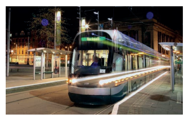
Nottingham Express Transit has 14.5 km of Factory Pre-Coated Rail

These advantages, combined with simplified construction and past performance enabled Trelleborg's Pre-Coated Rail to become a leading rail encapsulation solution system in the UK and Ireland.