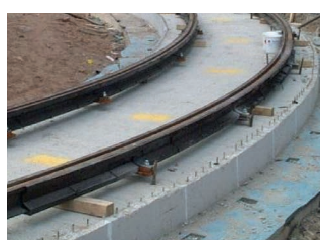
Pre-Coated Rail Track Under Construction

The innovative, factory-based process, used by Trelleborg, ensures efficient use of materials to produce cost effective encapsulated rail, particularly well suited for embedded rail renewal projects.